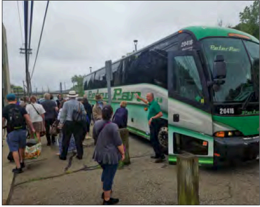
WASSAIC Metro North bus shuttle A3