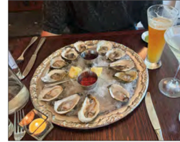
COMPASS Amenia restaurant is a must-visit; And More B1-4

A2 THE MILLERTON NEWS, Thursday, August 22, 2024